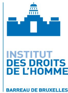
Institut des Droits de l'Homme du barreau de Bruxelles